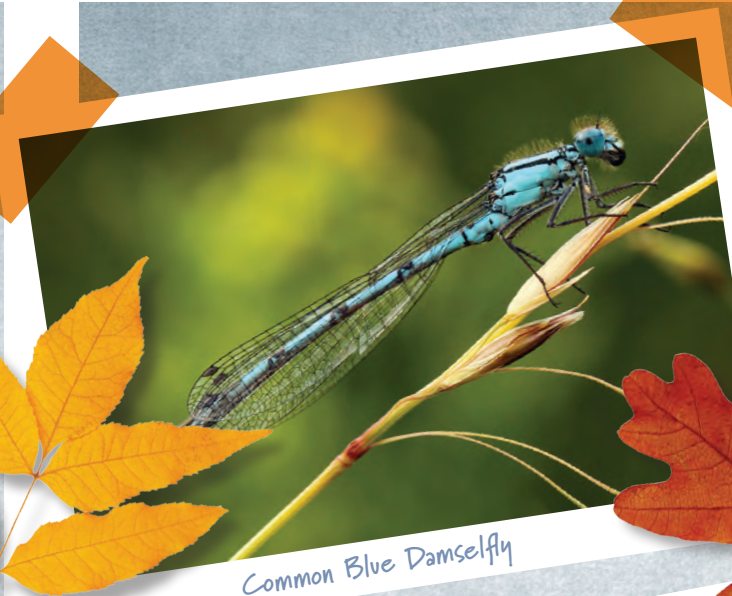
Common Blue Damselfly