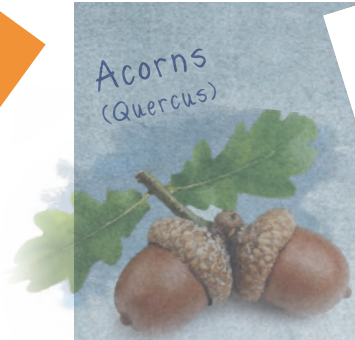
Acorns ( Quercus )