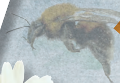
Bumblebee ( Bombus )