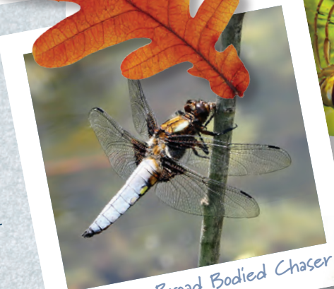
Broad Bodied Chaser