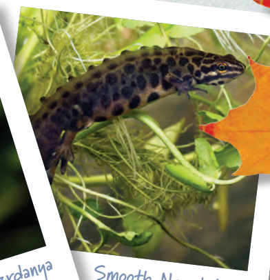
Smooth Newt Male