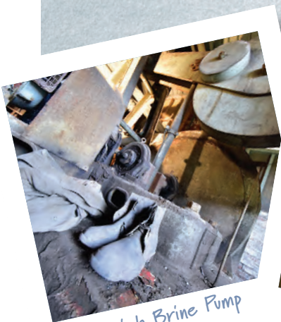
Middlewich Brine Pump

Murgatroyd's Brine Pump, Middlewich is being slowly brought back to life through restoration. The brine pumped here was of very high quality, enabling the works to expand to become one of Middlewich's most important employers until the 1970s. This is the last and most complete set of pumps in situ and can be visited on special pre-booked tours run by the town council. Call 01606 833434 .