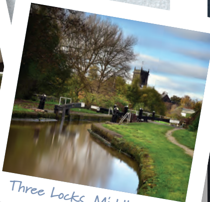
Three Locks, Middlewich