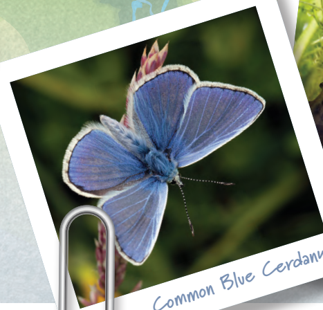
Common Blue Cerdayna