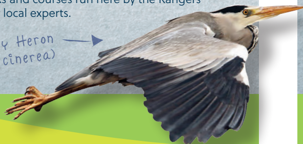
Grey Heron ( Ardea cinerea )

Ashton and Neumann's Flashes and Winsford Flashes today are crucial habitats for migratory and wading birds. Visit the areas to find out more about the regular walks, talks and courses run here by the Rangers and other local experts.