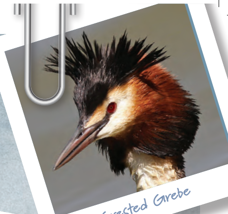
Great Crested Grebe