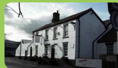
The Hanging Gate