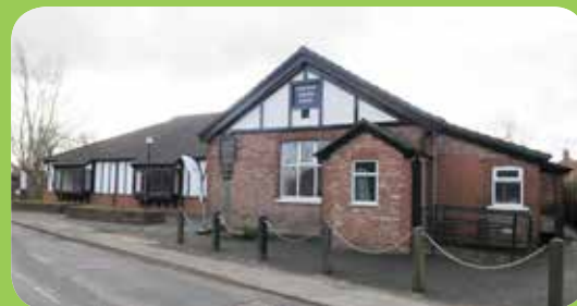
Acton Bridge Parish Rooms