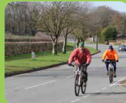
Cyclists on Sandy Lane